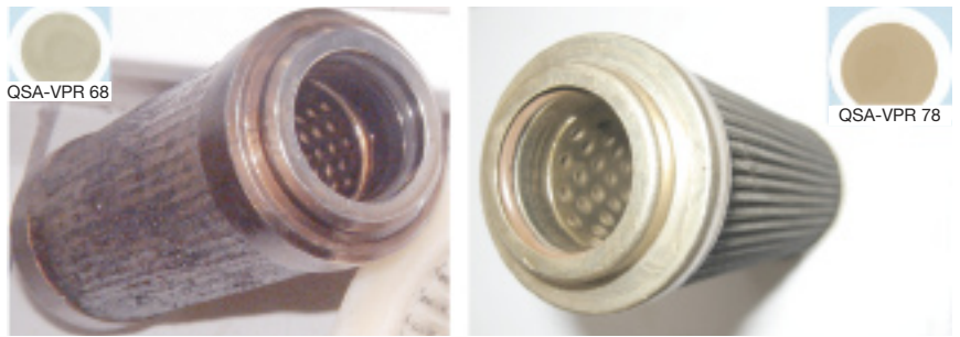
2, 3. The positive impact the CRV Plate has on varnish mitigation is easy to see by comparing the two photos of the filter for a fuel splitter valve. At the left, note the extensive fouling prior to installation of the CRV Plate. Replacement filter at right has 3000 hours of operation on the same oil after the CRV Plate was installed

The valve and filter were replaced and a CRV Plate was installed, but the LO was not changed-out. Fig 3 shows the filter after approximately 3000 hours of operation. Note that there is no agglomeration of varnish on the